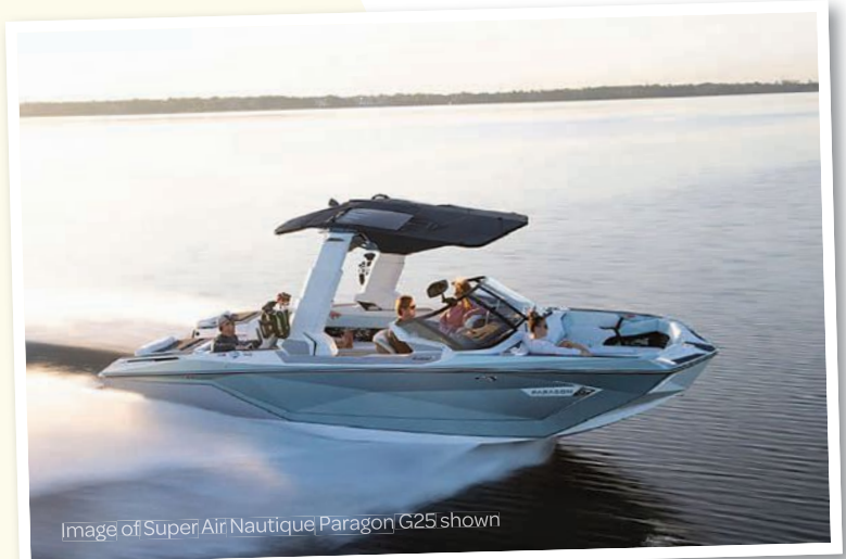
Image of Super Air Nautique Paragon G25 shown